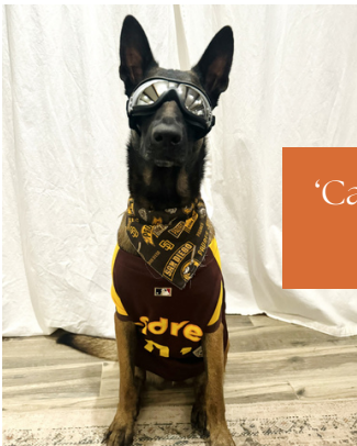
'Cause its root, root, root for the PAWdres!