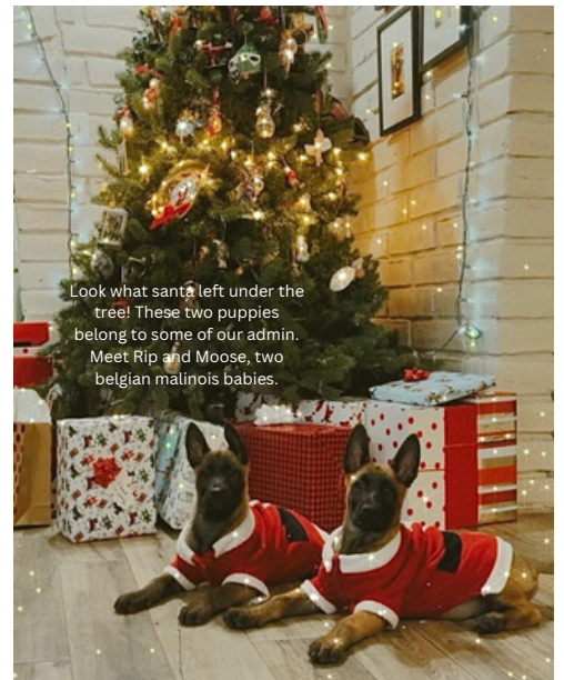
Look what santa left under the tree! These two puppies belong to some of our admin. Meet Rip and Moose, two belgian malinois babies.